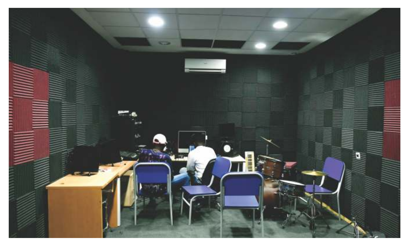
• An audio production studio in the T. Y. Danjuma Academic Complex at the main campus.