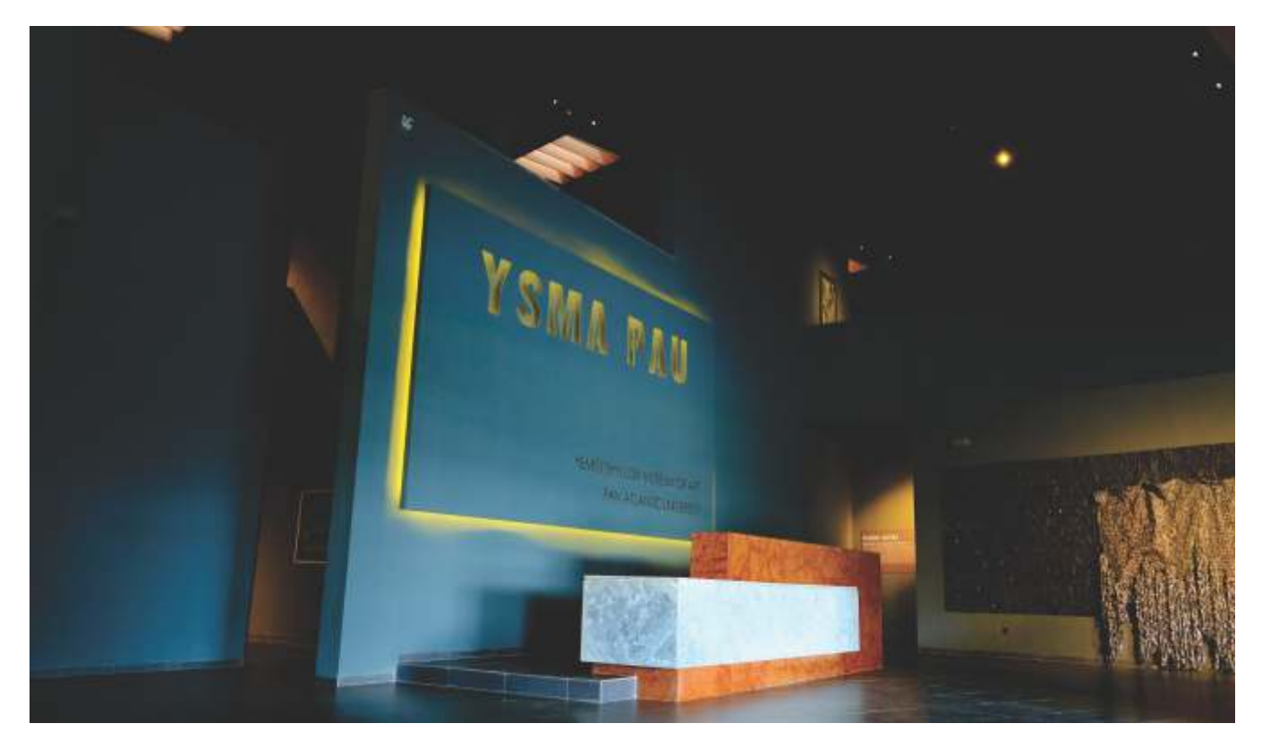
The entrance foyer at the Yemisi Shyllon Museum of Art