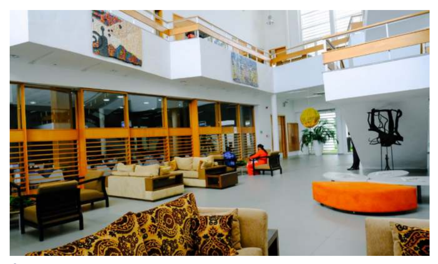
• A view of the interior of the Enterprise Development Centre building at the Lekki Campus

through the mobile app. The 800 went through a financial literacy and investment readiness training over six weeks across three different locations in Nigeria: Lagos, Port Harcourt and Abuja; while the third phase witnessed the selection of 160 outstanding women at the end of the second phase to receive further intensive support for a six-month period. While training for the 800 women in the second phase took on a blended approach, 500 others went through online training structured around a custom-built 'Road to Growth' curriculum.