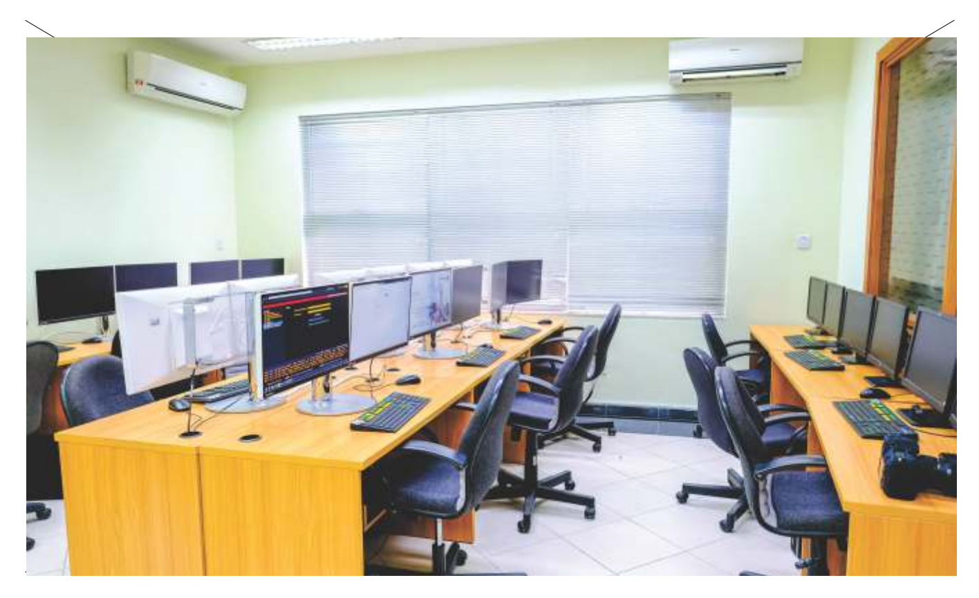
Bloomberg terminals at the Lagos Business School