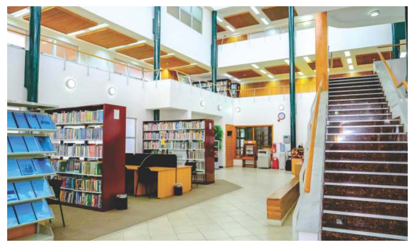
The library in the Lagos Business School