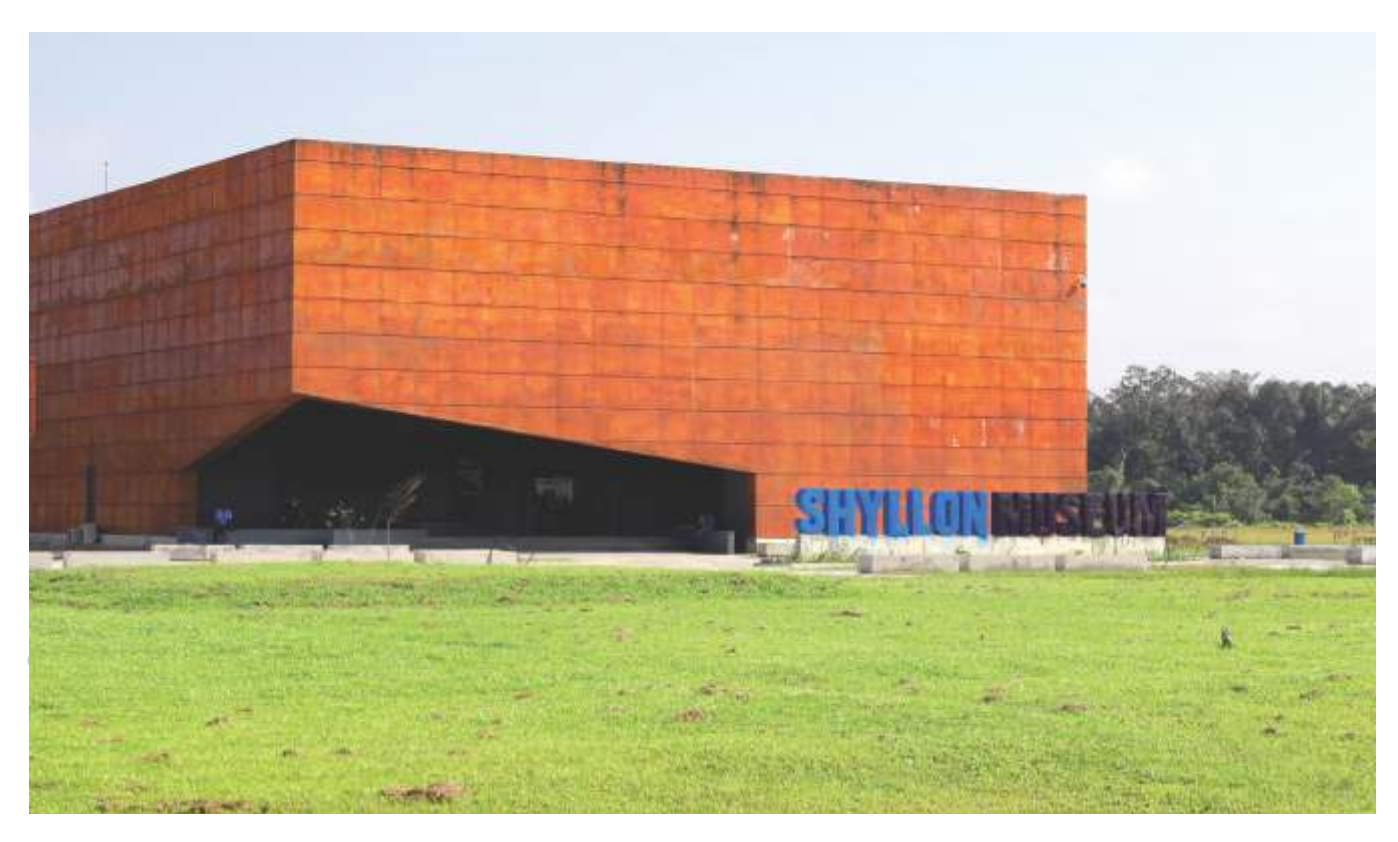
• The recently inaugurated Yemisi Shyllon Museum of Arts