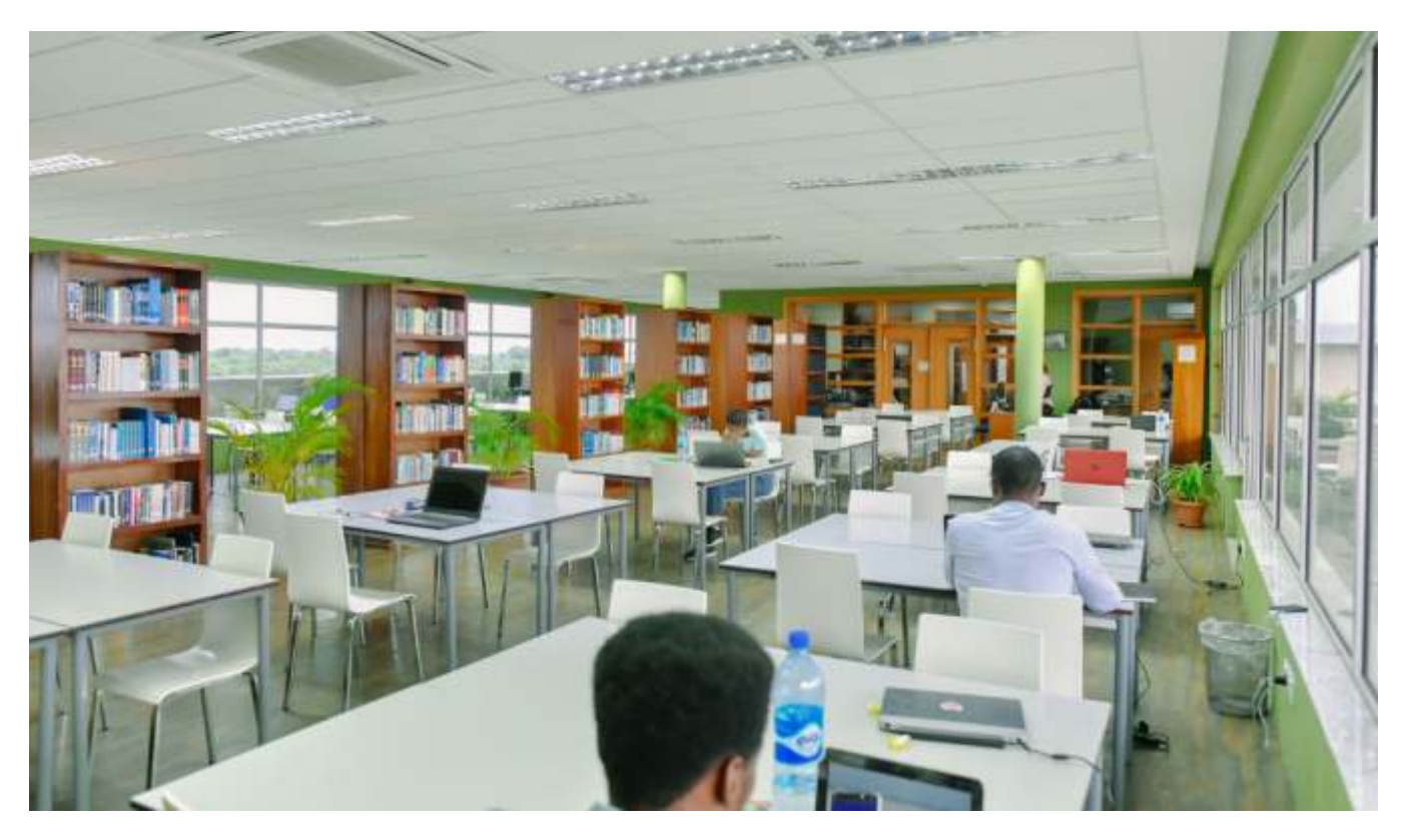
• The library in the T. Y. Danjuma Academic complex at the main campus.