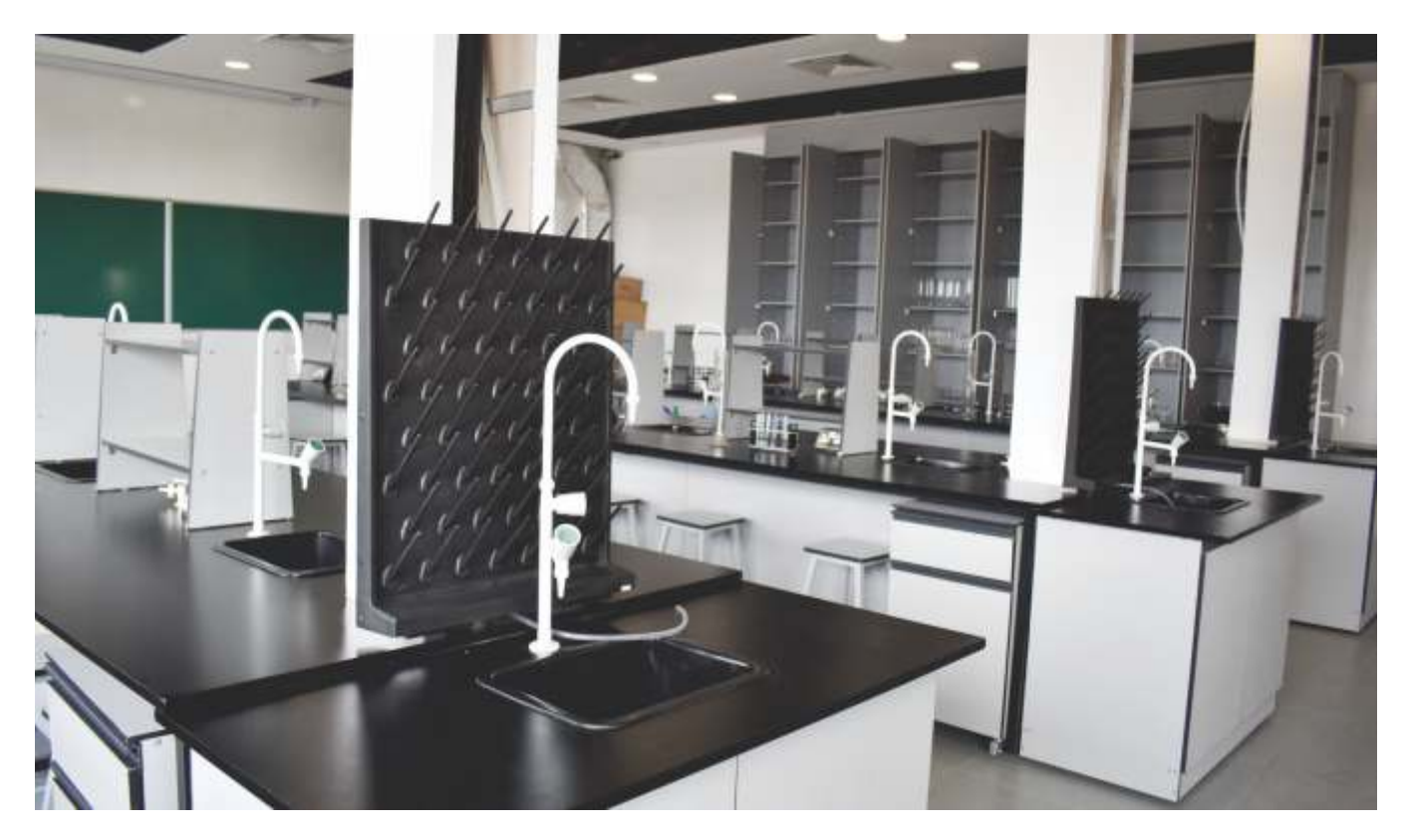
• A chemistry lab in the new School of Science and Technology building