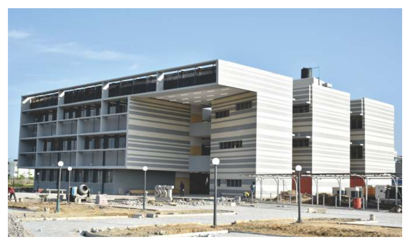
• The building for the School of Science & Technology (SST). Programmes are scheduled to begin in the new school in October, 2020 (subject to regulatory approval).