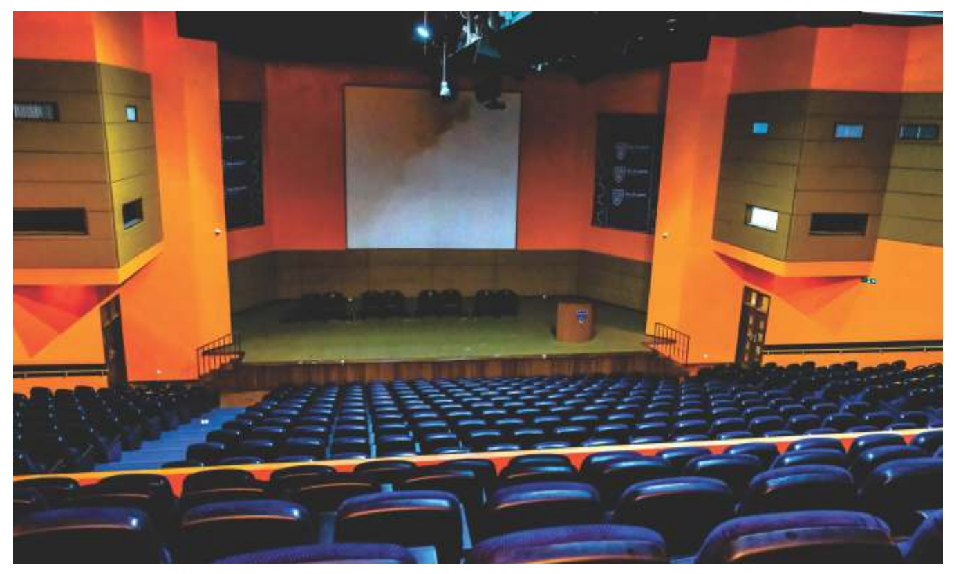
• An interior view of the Honeywell Group Auditorium at the Lagos Business School.

CSR interventions that Work- October 15, 2018 Leading for Impact- Monday, March 4, 2019