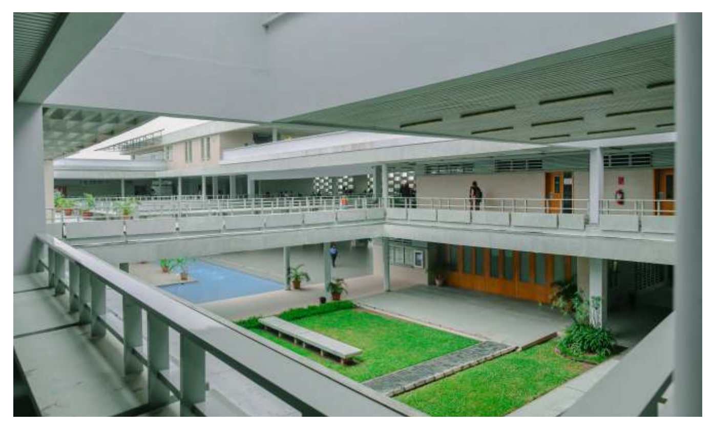
An interior view of the T. Y. Danjuma Academic Complex at the main campus of the University.

"Humanities in Transition" international congress, Barcelona.