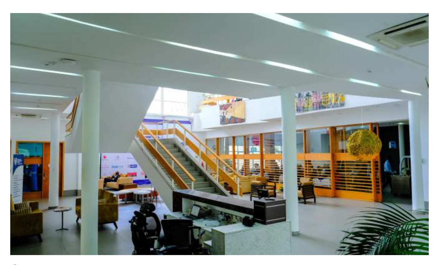
• A view of the interior of the Enterprise Development Centre building at the Lekki Campus

was aimed at providing information to assist the MCF Nigeria team as they develop a strategy for Nigeria. Despite narrowing MCF's engagement into two sectors – Agriculture and Creative Industries – understanding how best to intervene in those sectors and be able to reach the job creation target, required a deeper understanding of the sectors' policies, financing and talent gaps, their implications for growing the sectors. The study entailed overall mapping of the Nigerian private sector.