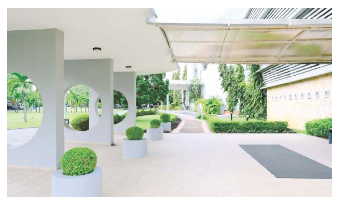
An external view of the Lagos Business School

<u>Adeola, O.</u>, & Evans, O., (2018). Digital health: ICT and health in Africa. Actual Problems of Economics , 8, 69-83.