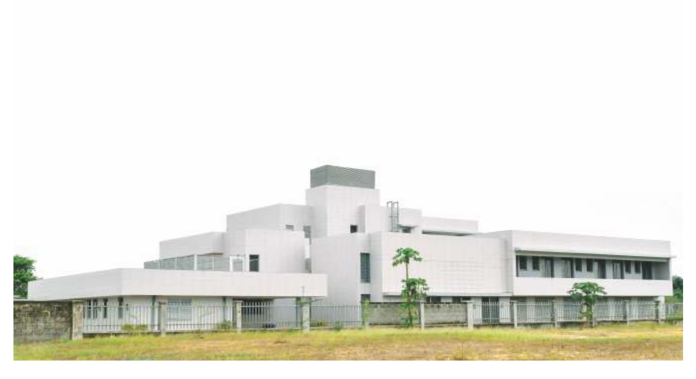
• Eleko Study Centre is a centre for extra-curricular studies for students