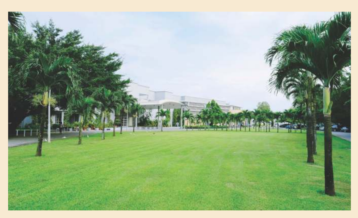
• Lekki Campus. This campus is home to both the Lagos Business School and the Enterprise Development Centre